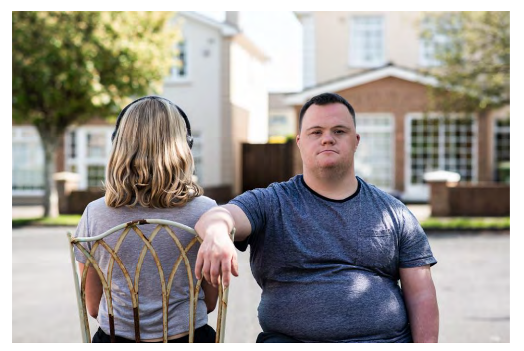
Making a Mark