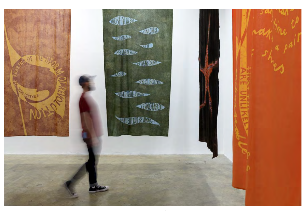
Soon (In 45 Years' Time) / Gan Mhoill (IgCionn 45 Bliain)