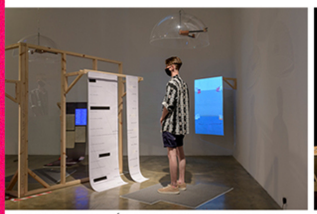
All Our Relations/Ár gCaidreamg Uilig, exhibition view, Project Arts Centre, 2021.