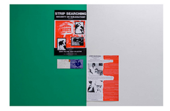
Open the book at a different page – Derry Film and Video Workshop, exhibition view, Project Arts Centre, 2021.