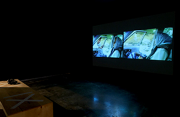
All Our Relations/Ár gCaidreamg Uilig, exhibition view, Project Arts Centre, 2021.