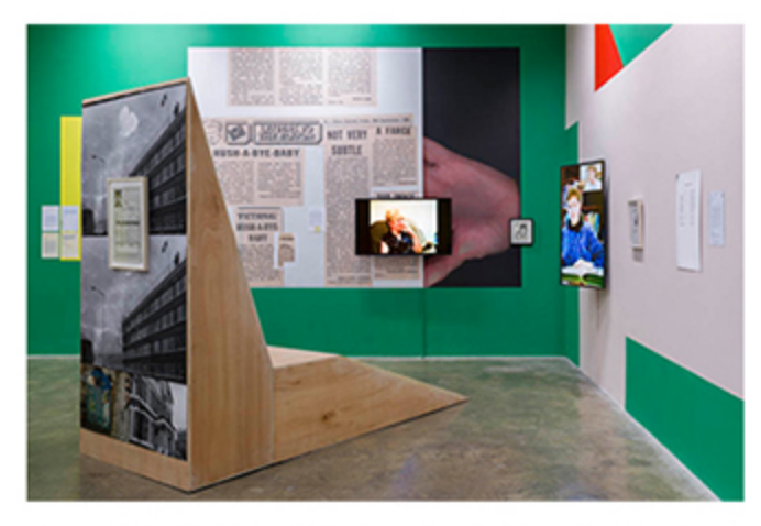
Open the book at a different page – Derry Film and Video Workshop, exhibition view, Project Arts Centre, 2021.